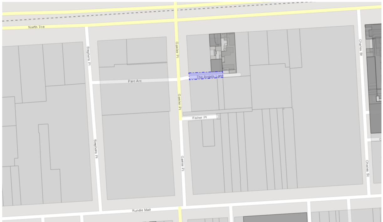
Figure 1. Designated location of The Angels Lane (2019)